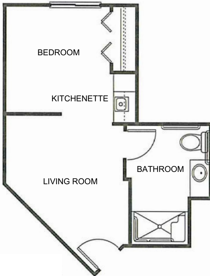
Sample Floor Plan