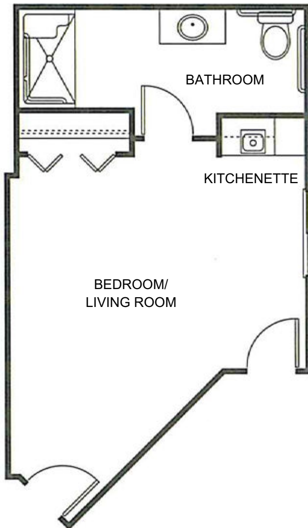
Sample Floor Plan