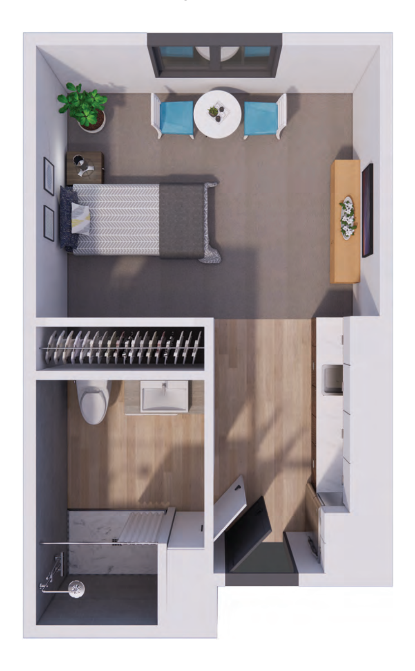
STUDIO Starting at 333 sq. ft.