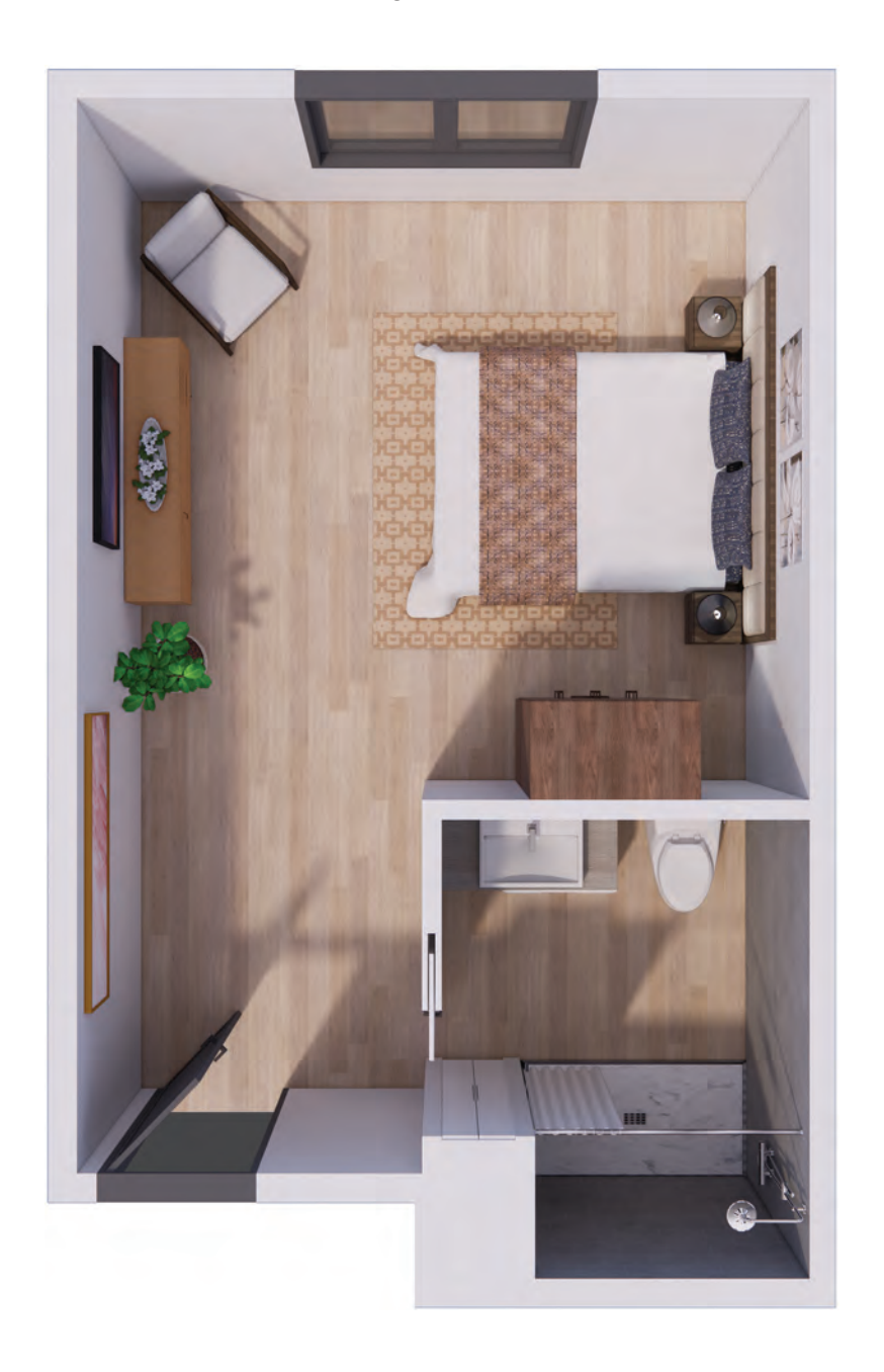
PRIVATE Starting at 333 sq. ft.